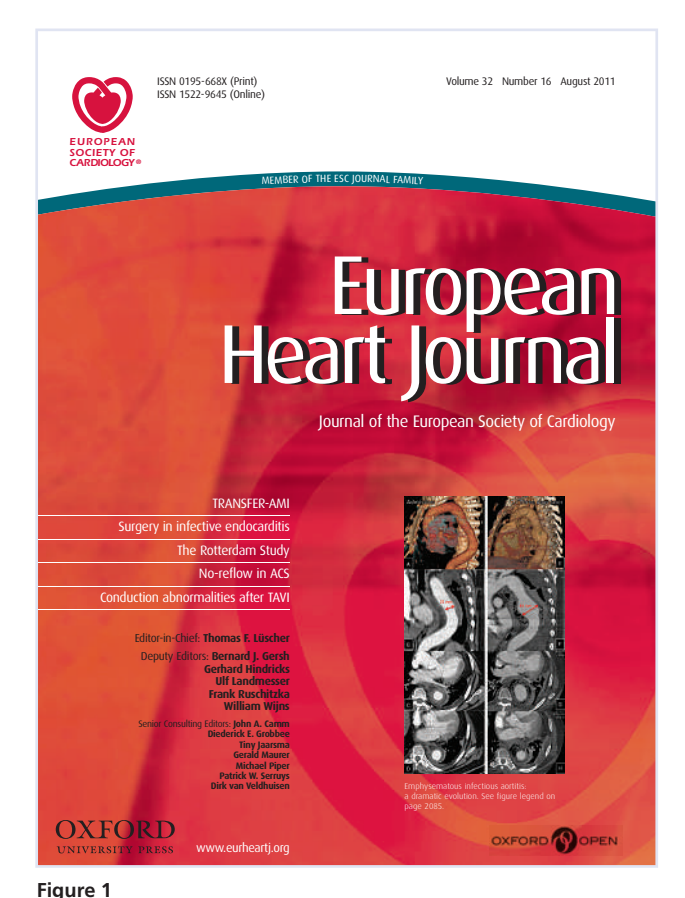
The European Heart Journal cover.

each year due to the fact that they are either too specialised, too technical or only interesting for subspecialists rather than the general cardiologists reading the European Heart Journal . The ESC journal family is the only ESC journal fam-