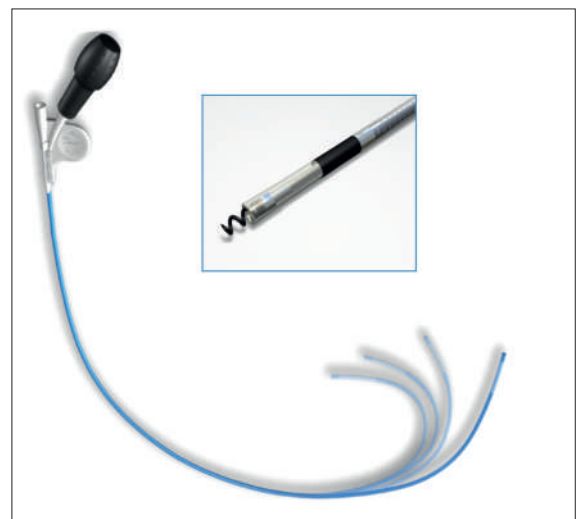
Figure 2: Deflectable 8.5F guiding catheter and SelectSecure 3830 fixed helix lead (reproduced with permission from Medtronic).