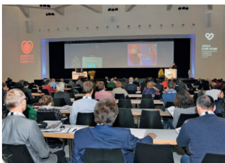
Audience, Cardiology Update 2015.