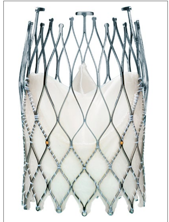
Figure 2: The Allegra transcatheter heart valve. The Allegra is a self-expanding transcatheter aortic valve prosthesis that incorporates supraannular bovine pericardial leaflets. Due to the straight shape of the frame, it has the potential to minimise interference with the frame of degenerated THVs.

All of the currently available THVs can be implanted in degenerated THVs, but they all have some limitations. The Allegra has a relatively straight shape, which minimises interference with the frame of the degenerated THV (fig. 2) [4]. In addition, the supra-annular position of the leaflets may result in acceptable gradients even in narrow anatomies or underexpanded THVs. In our patient, other valves may have been less well suited. For example, the height of a Sapien 3 (Edwards Lifesciences, Irvine, USA) may not be sufficient to fully stent a degenerated CoreValve open, especially in the presence of a torn leaflet. Implantation of an Evolut R inside a CoreValve may result in a lot of Nitinol struts inside the aortic sinus and the ascending aorta, resulting in difficult coronary access. Finally, the upper crown of the ACURATE neo (Boston Scientific, Marlborough, USA) may interfere with the frame of the CoreValve, resulting in incomplete expansion. Nevertheless, it may be challenging to access the coronary arteries after implantation of an Allegra inside a self-expanding valve. In conclusion, this very early experience suggests that the Allegra THV may be well suited for the treatment of degenerated THVs.